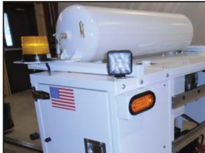
Remote key-fob actuated emergency LED strobe beacon, LED work lights, and rear-facing LED strobe lights with manual override for operator safety.