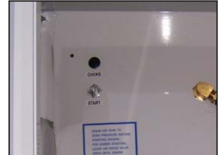
Remote engine controls in right front compartment.