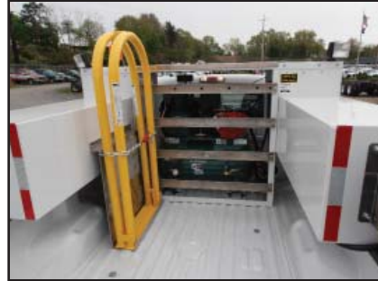
13 hp Honda mounted on 30 gal. air tank 13 hp Honda with 35 gal. overhead air tank 20 hp Kohler with 35 gal. overhead air tank