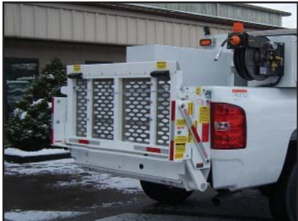
1300 lb. LA56 liftgate with heavy duty steel frame and aluminum diamond tread deck plate. Self locking two-point spring loaded lock system locks platform closed when stored for travel. Powder-coat paint finish.