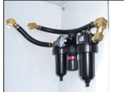
Air, Water, Oiler available in right front compartment.